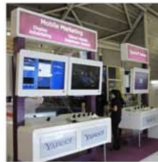
COMMUNIC & BROADCAST ASIA 2009