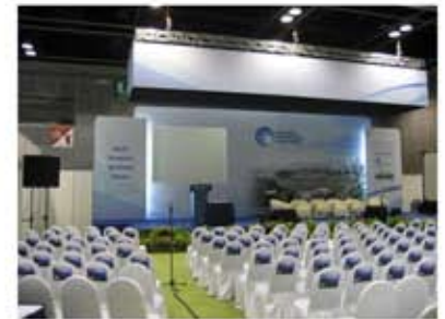
Singapore International Water Week